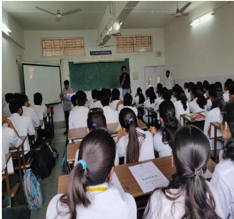
Audience- Staff and students.