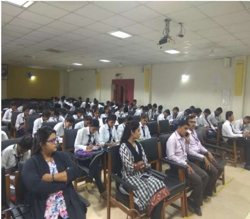
Audience- Staff and students.